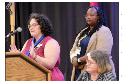
Presenters shared the great works being done by the organizations we support.

Share the work of these terrific organizations with your councils—and continue to show them your financial support!