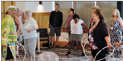
An Indigenous hoop dancer entertained at Wanuskewin Park on Sunday morning.

The fabulous Filipino welcome feast and flower dancers kicked off the convention for me. The wonderful Wanuskewin