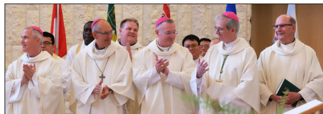
Our faithful clergy at the opening Mass.